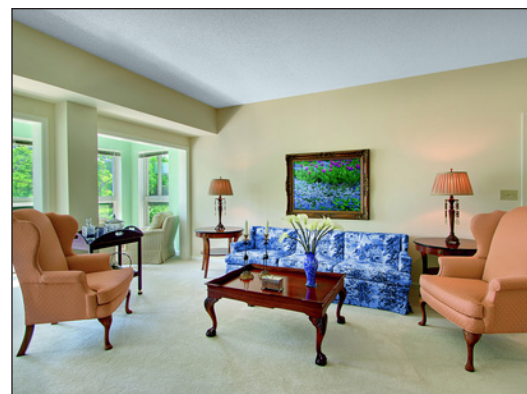
Cape Hatteras Living Room (Example)