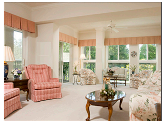
Cape San Blas Living Room (example)