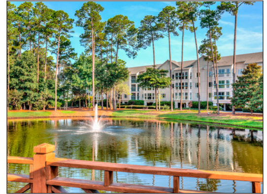
Main Clubhouse Exterior